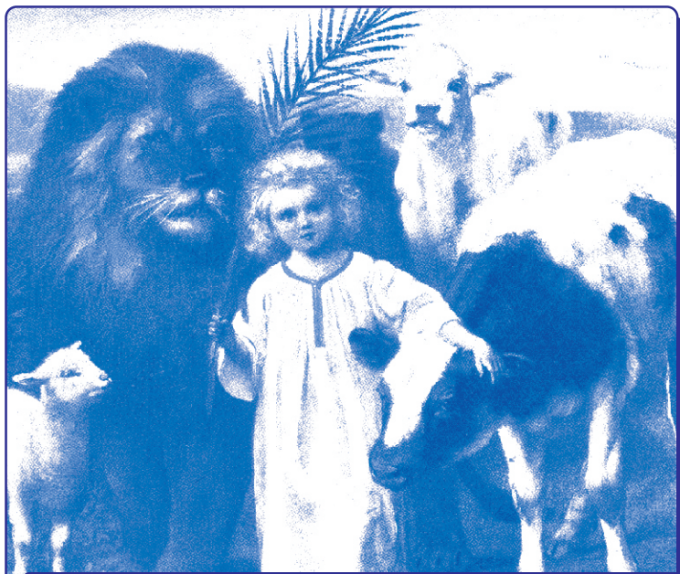
The wolf also shall dwell with the lamb, and the leopard shall lie down with the kid; and the calf and the young lion and the fatling together; and a little child shall lead them. (Isaiah 11:6)

bazaalibwa mu kibi (Zabbuli 51:5), tebasobola ku tuukiriza mateeka ga Katonda. Amateeka gaabayamba okumanya obubi era nga tebasobola kugatuukiriza. Kale ng'Abayudaaya tebasobola kutuukiriza mateeka, balikaabiride Mukama okufuna